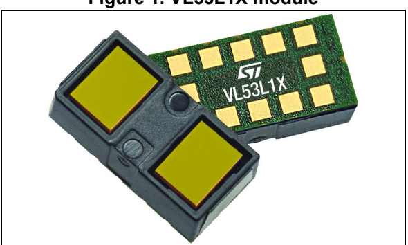
Figure 1. VL53L1X module

The VL53L1X combines an IR emitter and a range sensor in a two-in-one, ready-to-use reflowable package.