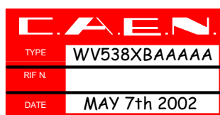
Fig. 1.1: Model type label (example: V538 AB)

The board can be purchased equipped with both the P1 and the PAUX connectors ( Mod. V538 AA 2 ), or with the P1 only ( Mod. V538 AB ). Both the models support live insertion. The Mod. V538 AA requires the VME430 backplane. The models can be distinguished by a label placed on the printed board (soldering side), see Fig. 1.1.