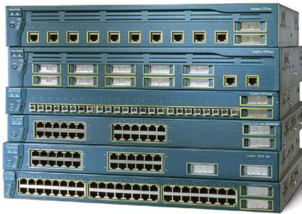
Figure 1. Catalyst 3550 Series Switches

and routed information protocol (RIP) routing functionality. The EMI provides a richer set of enterprise-class features including advanced hardware-based IP unicast and multicast routing and the Web Cache Communication Protocol (WCCP). After initial deployment, the EMI Upgrade Kit gives users the flexibility to upgrade to the EMI. The Catalyst 3550-12T and 3550-12G are only available with the EMI.