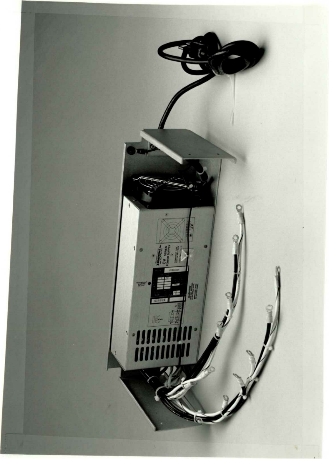
VMIVME-PS1-072, -100, and -120 Power Supplies